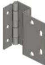
*OPTION 20 Dull Chrome Overlay Hinge *OPTION 24 Stainless Steel Overlay Hinge