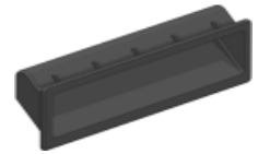
OPTION 64 5" Black Flush ABS Pull 64B Beige, 64G Gray, 64W White