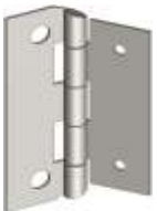
OPTION 21 (Standard) Chrome Hinge OPTION 22 Black Hinge *OPTION 23 Stainless Steel Hinge

Mott cabinets come with durable 14 gauge, five knuckle hinges. Hinges are available in black powder coat, chrome plated or stainless steel finishes. Please use the option numbers below to specify the hinge of your choice.