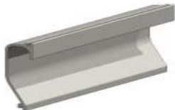
OPTION 65 4" Flush Aluminum Pull For Doors and Drawers