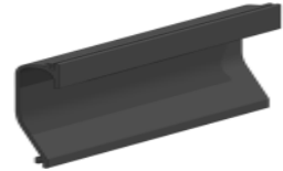
OPTION 66 4" Black Flush PVC Pull For Doors and Drawers