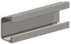
OPTION 65 4" Flush Aluminum Pull For Sliding Doors