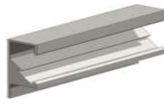
*OPTION 67 Flush Full Width Pull