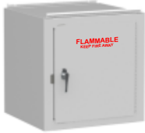
up to 24" wide