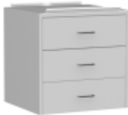
up to 24" wide