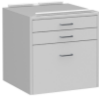
up to 24" wide