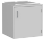
up to 24" wide