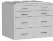
30" and wider