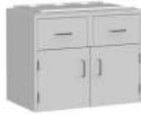
30" and wider