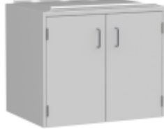
30" and wider