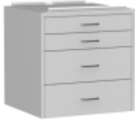
up to 24" wide