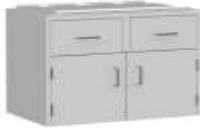
30" and wider