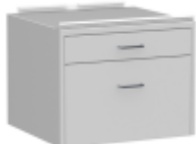
up to 24" wide