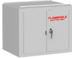
30" and wider