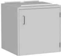
up to 24" wide