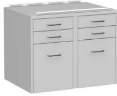
30" and wider