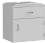
up to 24" wide