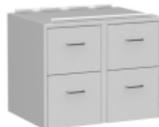
30" and wider