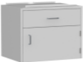
up to 24" wide