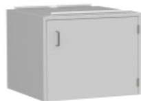
up to 24" wide