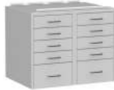
30" and wider