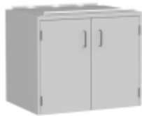
30" and wider