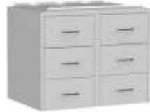
30" and wider