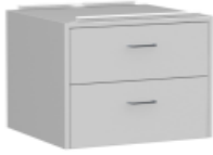
up to 24" wide