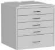
up to 24" wide