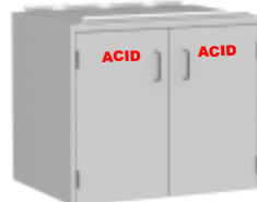
30" and wider