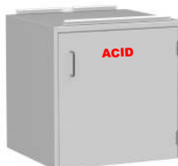
up to 24" wide