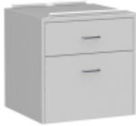
up to 24" wide