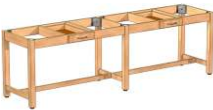
Six Leg Combination Table