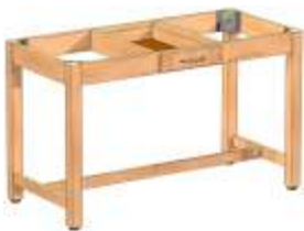
Standard "H" Frame Table