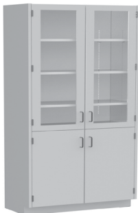
30" and wider