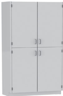
30" and wider