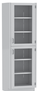
up to 24" wide