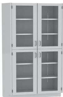
30" and wider