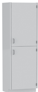
up to 24" wide