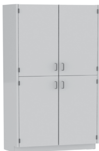
30" and wider