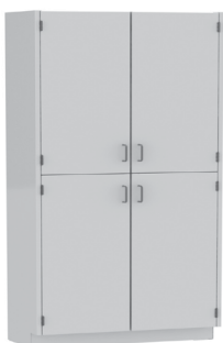
30" and wider