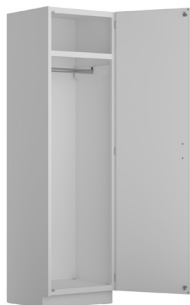
up to 24" wide