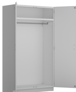
30" and wider