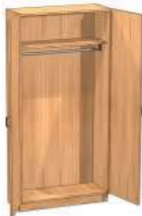
30" and wider