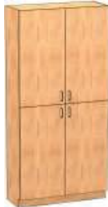
30" and wider