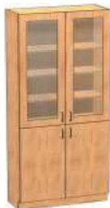
30" and wider