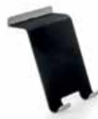
cell phone holder NV-PHN-79