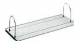
shelf NV-SWSHV-600 23.62"w x 12"d NV-SWSHV-600 31.5" w x 12"d NV-SWSHV-600 39.37"w x 12"d