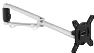
my arm monitor arm NV-MA-CM