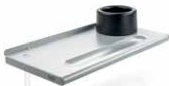
multi storage board NV-MSB-99