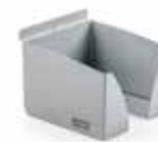
memo holder NV-MB-39