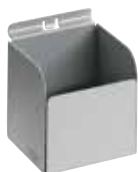
pura-line pen cup NV-PBH-69