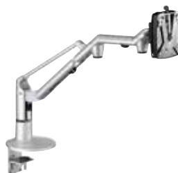
LifTEC arm III NV-LT-3