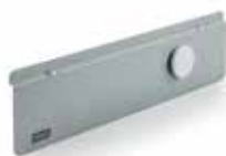
magnetic strip NV-MS-109