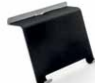
tablet holder NV-TH-89