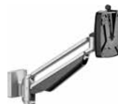
slatwall monitor arm NV-CLII-209