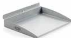
penda small multi-purpose box NV-SB-49