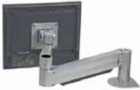
monitor arm* IN-7000-FM