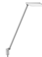
attenzia complete LED task light NV-AZ-2109