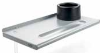
multi storage board NV-MSB-99