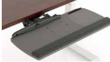
keyboard tray WR-ST185