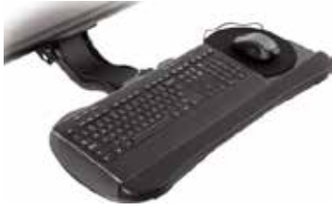
articulating slide-out tray* IN-8491-8495