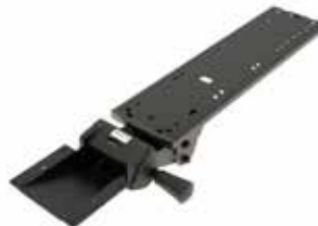
keyboard arm WR-3170