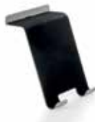
cell phone holder NV-PHN-79