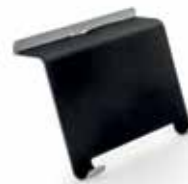
tablet holder NV-TH-89