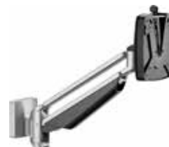
slatwall monitor arm NV-CLII-209