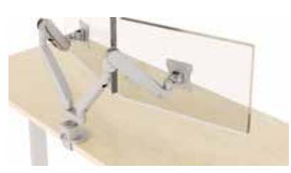
monitor arms WR-2SDA-TPCCG