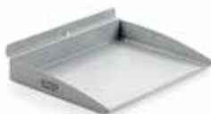
penda small multi-purpose box NV-SB-49