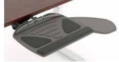
keyboard tray WR-UB2180