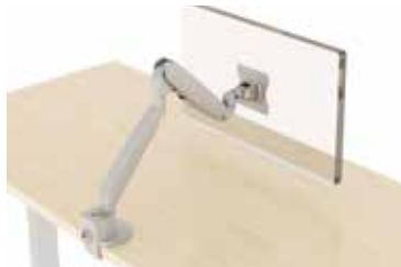
monitor arm WR-1SDA-CCG