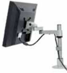
monitor arm* IN-9112-S-FM