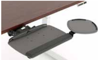
keyboard tray w/mouse pad WR-UB2100