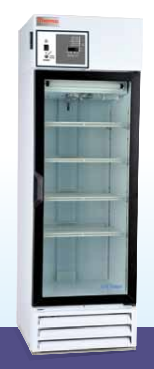
12 cu. ft. lab refrigerator with glass door, model no. MR12PA-GAEE-TS