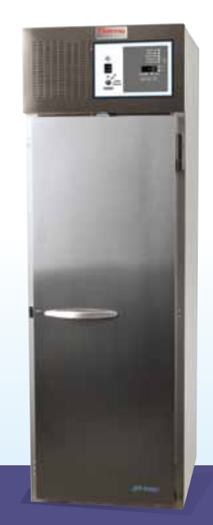
23 cu. ft. lab freezer with solid stainless steel door, model no. MF25SS-SAEE-TS