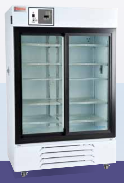
Thermo Scientific GP Series Chromatography Refrigerators