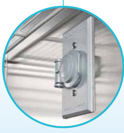
Side access ports