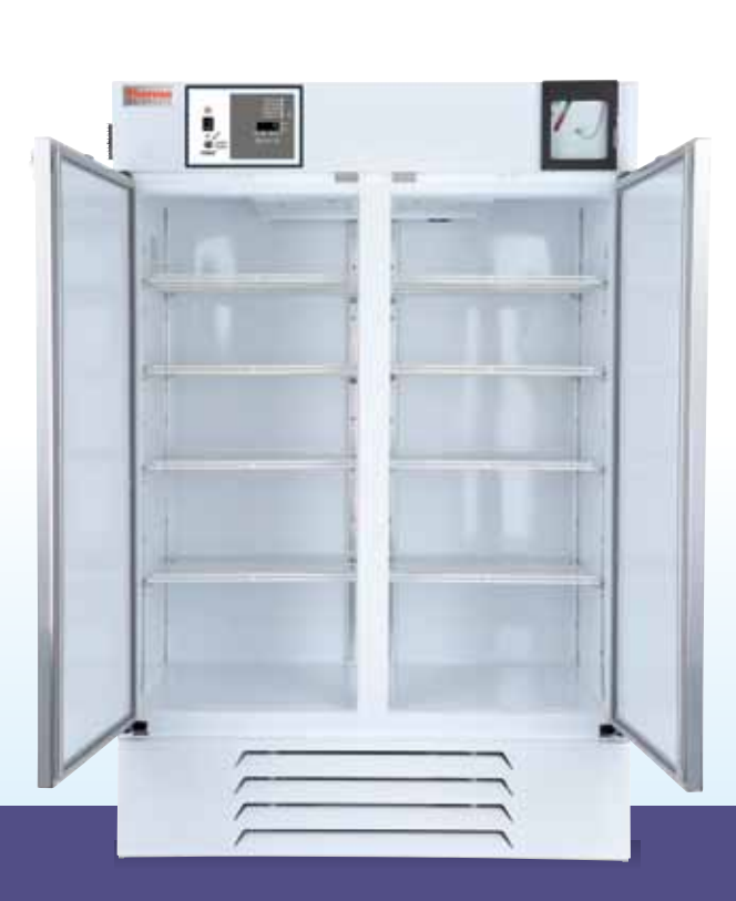
49 cu. ft. lab refrigerator with solid stainless steel doors and chart recorder, model no. MR49PA-SARE-TS