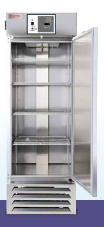
27 cu. ft. lab refrigerator with solid stainless steel door, model no. MR30SS-SAEE -TS