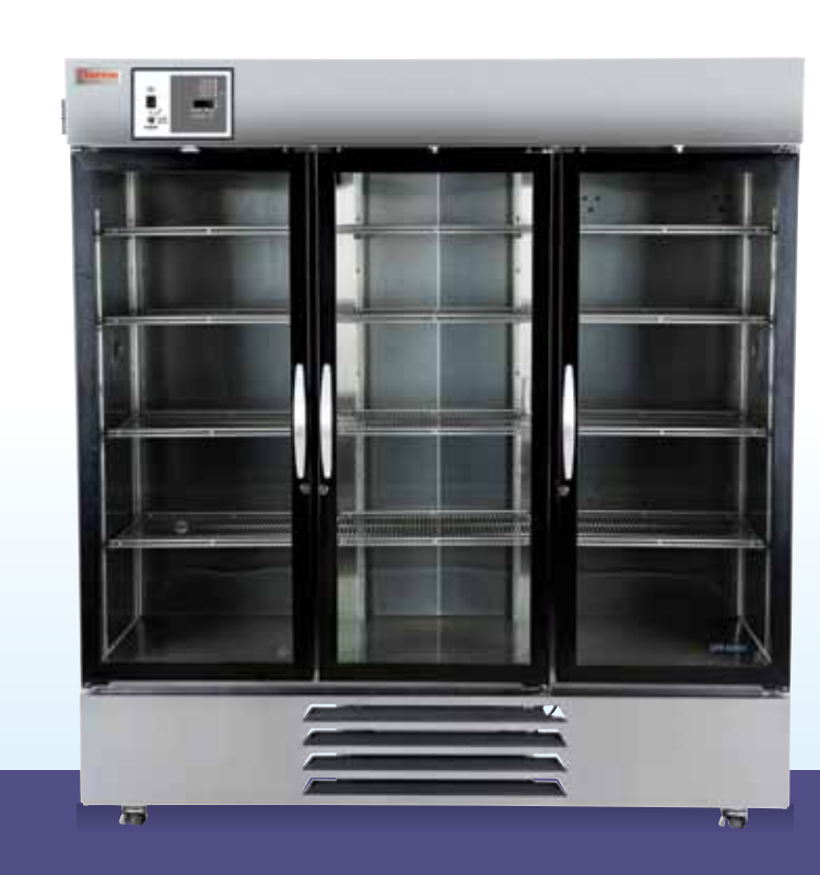
72 cu. ft. lab refrigerator with glass doors, model no. MR72SS-GAEE-TS