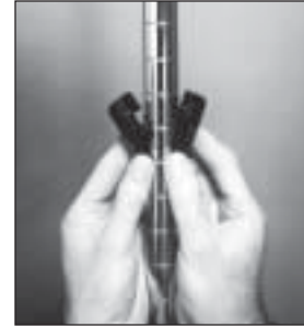
Super Erecta Split Sleeves

Every Metroseal 3 shelf and post is backed by a limited 12-year warranty against surface rust formation.