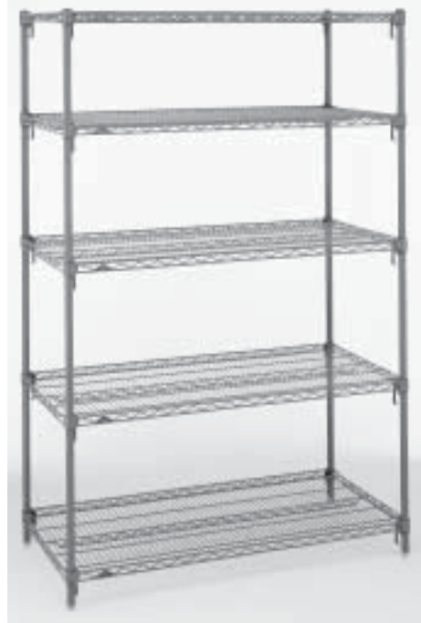
Super Adjustable Super Erecta