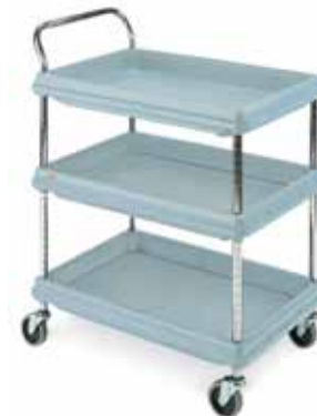
3-Shelf Deep Ledge Utility Cart