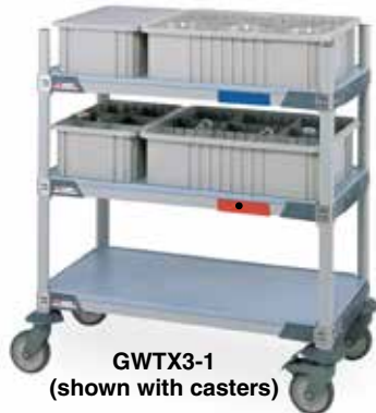
GWTX3-1 (shown with casters)