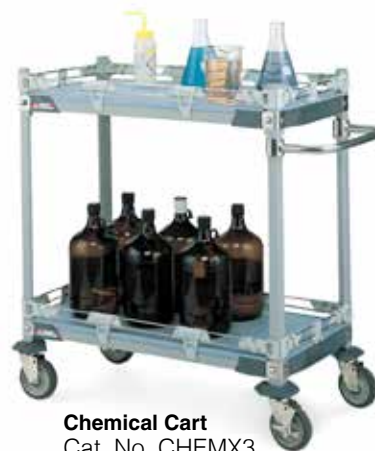
Chemical Cart Cat. No. CHEMX3 (Casters included)