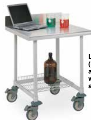
LTM30XUS3 (Shown with accessory wire shelf and casters)