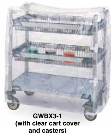
GWBX3-1 (with clear cart cover and casters)