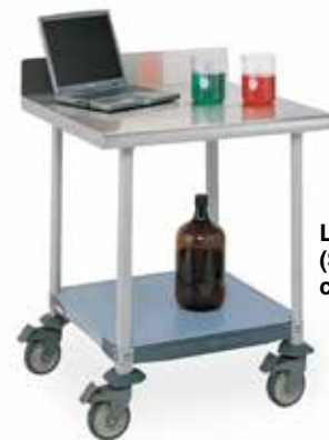
LTM30XS3 (Shown with casters)