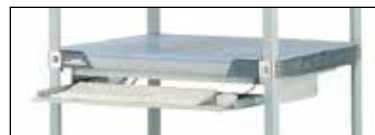
Cat. No. KBX

Dimensions: 2 1/4"W.x13"L.x4 1/4"H. (57x330x108mm)