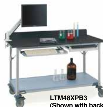
LTM48XPB3 (Shown with backplash accessory and casters)

Note: Lab Worktables are load rated at 50 lbs. (23kg) per square foot up to a maximum of 600 lbs. (273kg), assuming load evenly distributed.