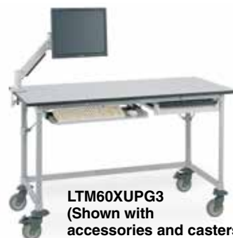
LTM60XUPG3 (Shown with accessories and casters)

Note: Lab Worktables are load rated at 50 lbs. (23kg) per square foot up to a maximum of 600 lbs. (273kg), assuming load evenly distributed. Worktables with Black Phenolic Top and 3-Sided Frame