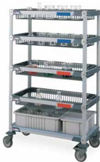
MetroMax i® 4 Basket Glassware Cart (Shown with casters and accessories)