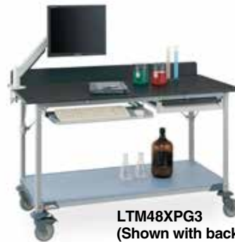
LTM48XPG3 (Shown with backplash accessories and casters)

Note: Lab Worktables are load rated at 50 lbs. (23kg) per square foot up to a maximum of 600 lbs. (273kg), assuming load evenly distributed. Worktables with Black Phenolic Top and 3-Sided Frame