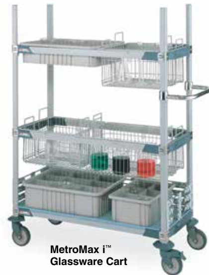
MetroMax i™ Glassware Cart