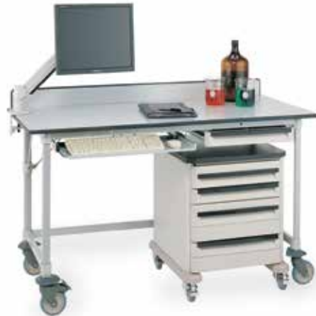
MetroMax i® Lab Worktable (Shown with accessories, casters and Starsys Cart)