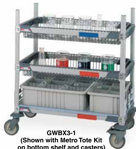
GWBX3-1 (Shown with Metro Tote Kit on bottom shelf and casters)