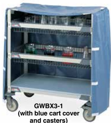
GWBX3-1 (with blue cart cover and casters)

*Each Metro tote kit includes TB93060NAT (1), TB92060NAT (1), DL93060NAT (3), DS93060NAT (3), DS92060NAT (3), and DL92060NAT (3).