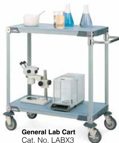
General Lab Cart Cat. No. LABX3 (Casters included)

Metro's Lab Cart line includes a General Lab Cart, Chemical Cart, and Mobile Desk. All carts are designed to offer superior corrosion resistance. Smooth rolling, 5" (127mm) polyurethane casters come standard with each cart. All shelves adjust in 1" (25mm) increments, offering precise shelf adjustment and maximum storage utilization.