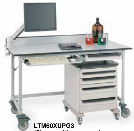
LTM60XUPG3 (Shown with accessories, casters and Starsys Cart)

Note: Lab Worktables are load rated at 50 lbs. (23kg) per square foot up to a maximum of 600 lbs. (273kg), assuming load evenly distributed.