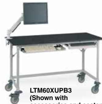
LTM60XUPB3 (Shown with accessories and casters)

Note: Lab Worktables are load rated at 50 lbs. (23kg) per square foot up to a maximum of 600 lbs. (273kg), assuming load evenly distributed. Worktables with Black Phenolic Top and 3-Sided Frame