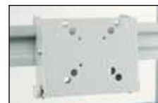
Cat. Nos. FM30X3/ FM36X3/FM48X3 (Cross Bar and Mounting Bracket included)