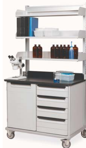
Mobile WorkCenter with Reagent Shelving

5" (127mm) Swivel/Lock (Directional) Casters (available by request) Other specialty caster options are available, consult your Metro representative.