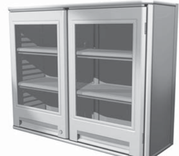
Double-wide Overhead Cabinet with Polymer Shelves and Locking, Clear Doors