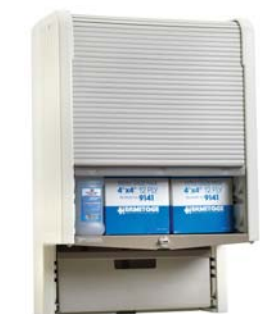
Tambour Door Overhead (Also available on Mobile WorkCenters)