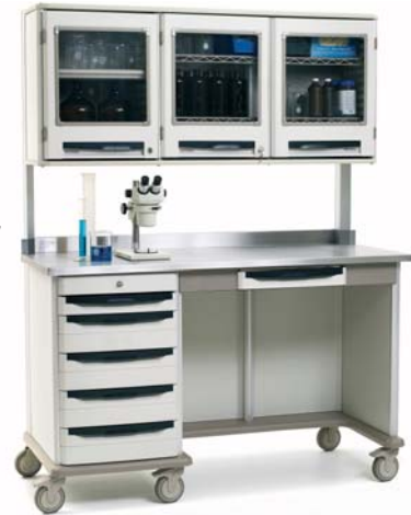
Triple-wide Mobile WorkCenter with Kneewell, Overhead Storage and Stainless Steel Top