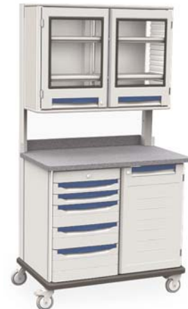
Model # SXRMENT2 with SXRDOH27P Overhead, (2) SXRDOHPS Shelves and Clear Locking Doors

* Triple-wide overhead cabinets are only offered as part of Mobile WorkCenter offering. Contact your Metro representative for more information.