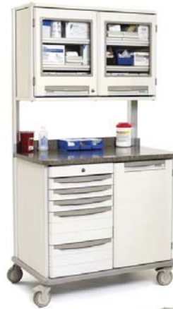
Double-wide Mobile WorkCenter with Laminate Countertop