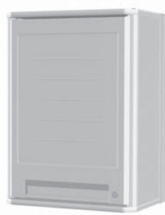
Single-wide Overhead Cabinet with Solid Door