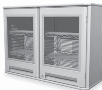
Double-wide Overhead Cabinet with Wire Shelves (2) and Locking, Clear Doors